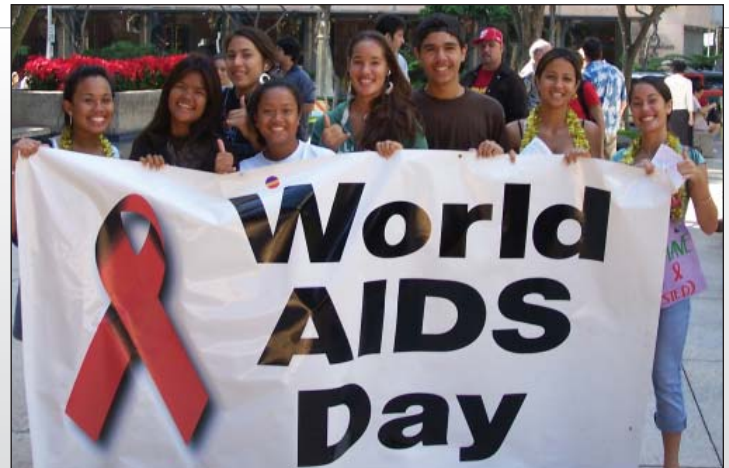
Students from Kailua High School at World AIDS Day

Life Foundation also runs a support group for young gay and bisexual men called MANA, providing a safe social alternative