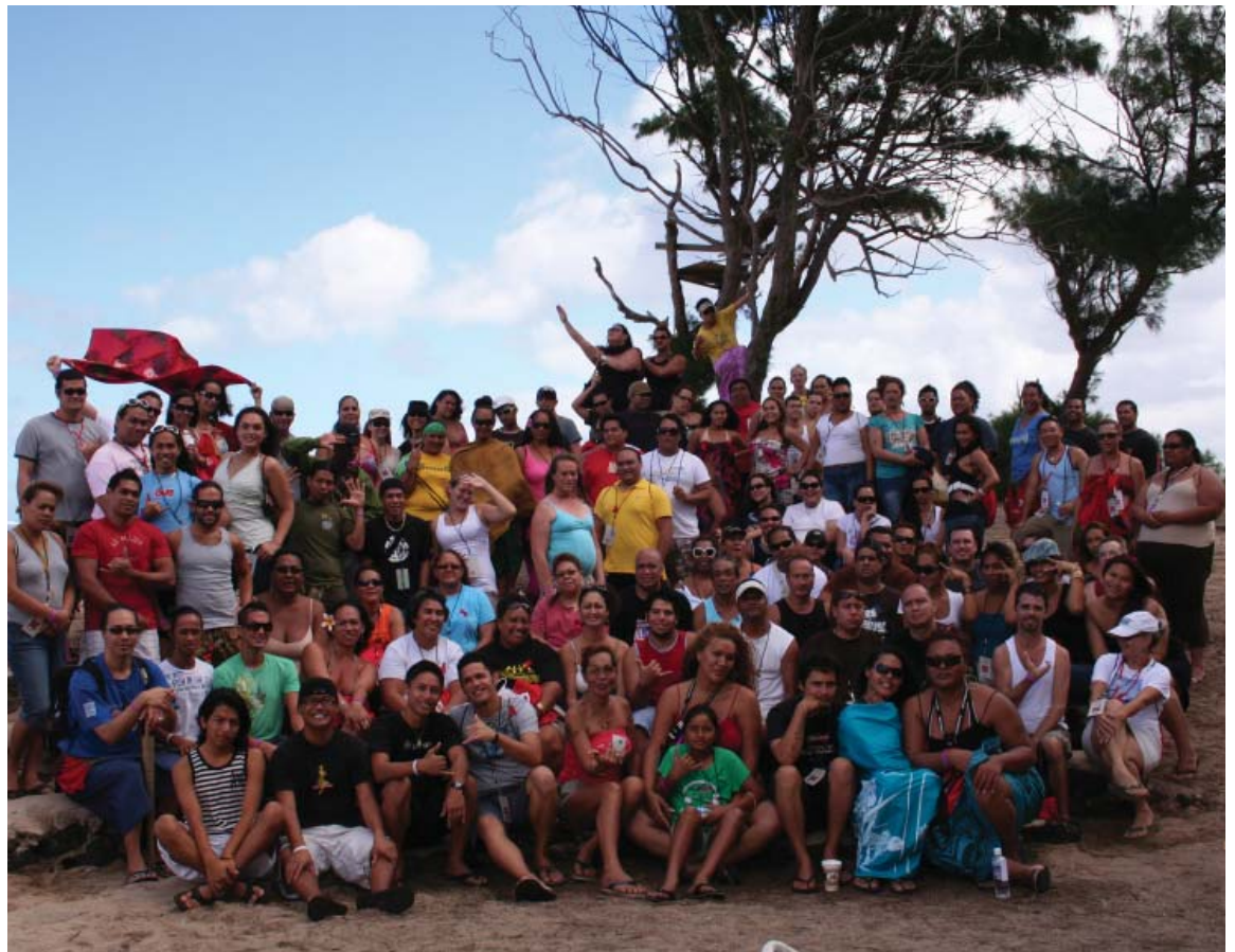
Participants of the 5th annual Life Foundation Native Hawaiian and Pacific Islander retreat.